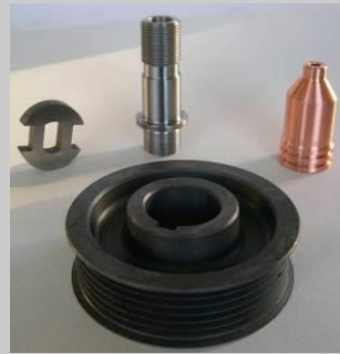
Oil pressure valves